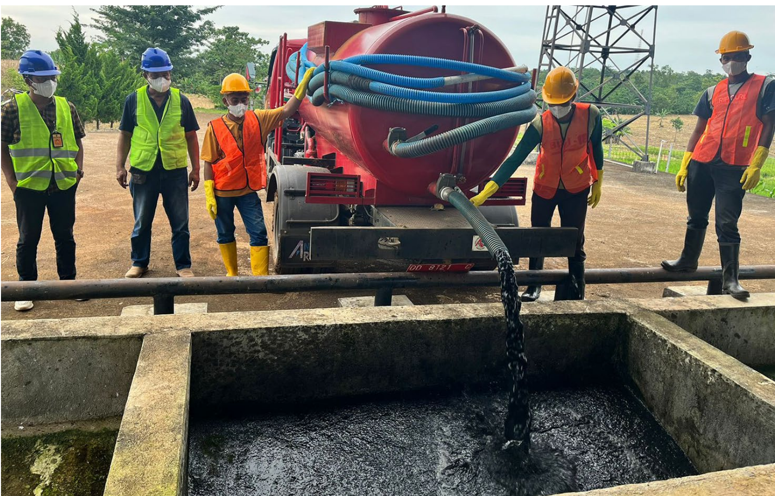
USAID IUWASH Tangguh

USAID INDONESIA URBAN RESILIENT WATER, SANITATION, AND HYGIENE (IUWASH TANGGUH)